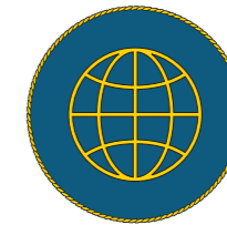
VII. World Religions