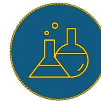
IV. Natural Sciences